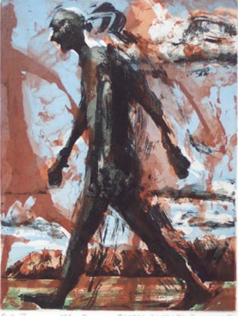
PAT MAR E CHAM MARLED D