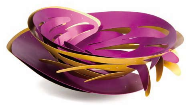
ABOVE: Yuri Kawanabe, Ritual ornament, Uzi-Switl , 2005, anodised aluminium, silver, 40 x 40 x 17 cm, collection the artist