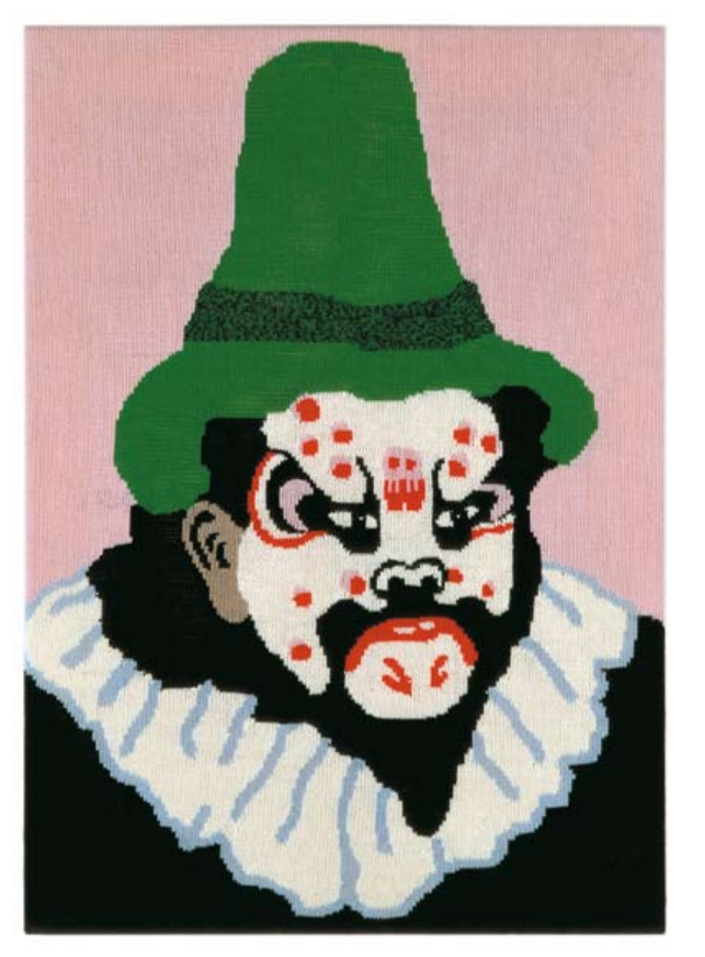
Renee So, The Merchant , 2005, knitted lambs wool, 70 x 40 cm, collection the artist, photograph John Bush.

26 July – 1 Sept 2007 | Opens 26 July, 5:30 - 7:30pm Toured by Museum of Brisbane, Brisbane City Council and supported by Visions of Australia