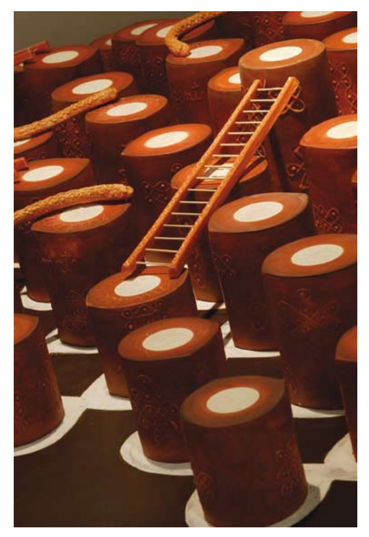
Jaishree Srinivasan, Revision (detail), 2005, ceramic (80 components), 24 x 150 x 150 cm overall, collection the artist, photograph David Sandison