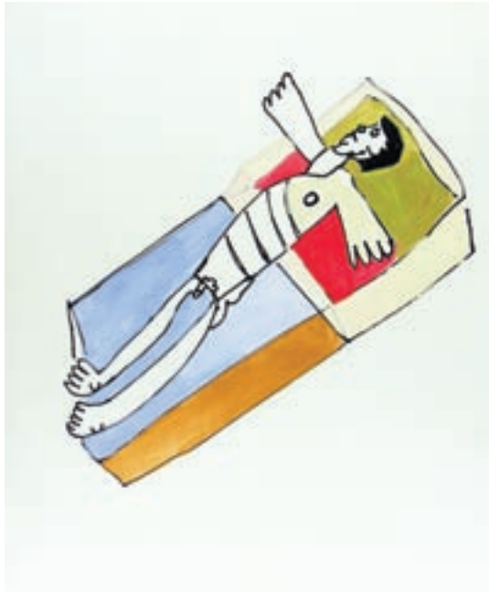
Wayne Marnell, Untitled (Figure) , 2006, gouache and pen on paper, 18.5x38 cm.