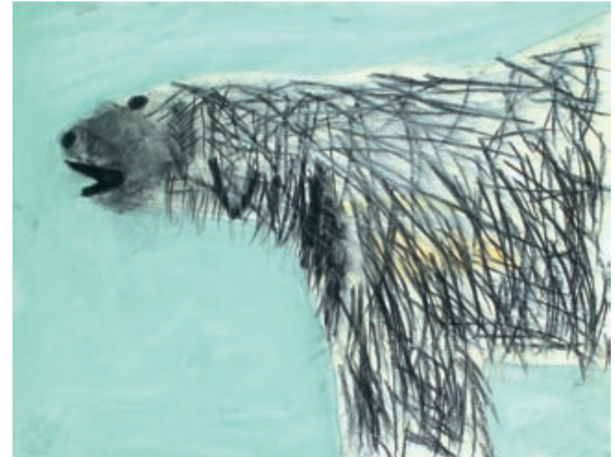
Alan Constable, Untitled (Polar Bear) , 1994, pastel on paper, 50x65 cm.

For more information, interviews or images please contact