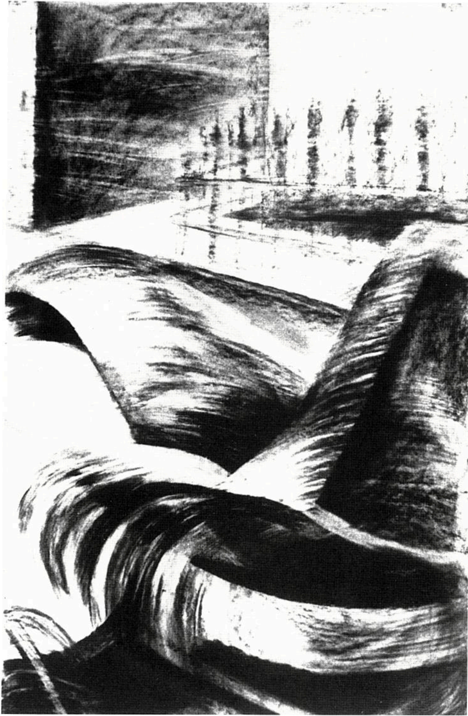
Rae Andrews Momentum 1987 (detail from a series of 9), charcoal on paper, 101.5 x 66.5 cm