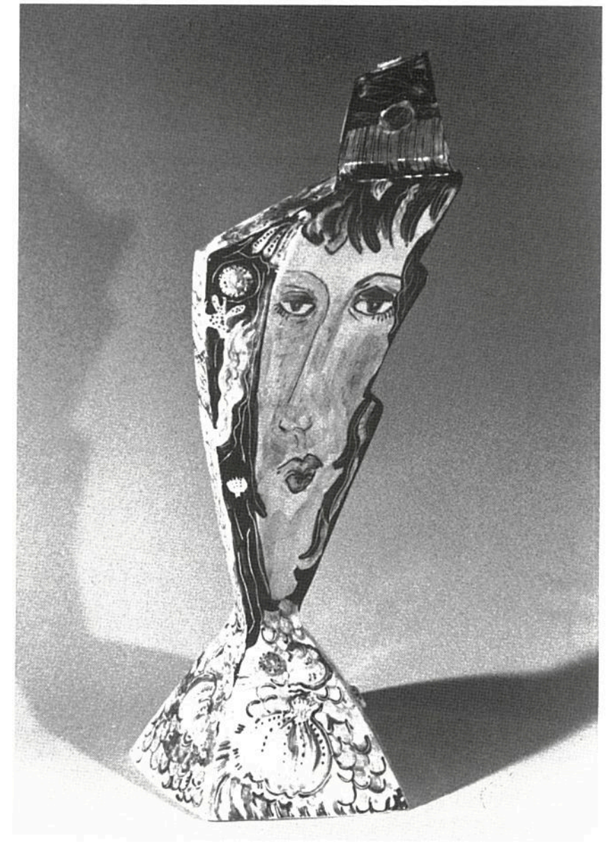
Brigiat Brunic I See What I Sea 1987, slip cast earthenware, underglaze, 49 x 16 x 18.5 cm