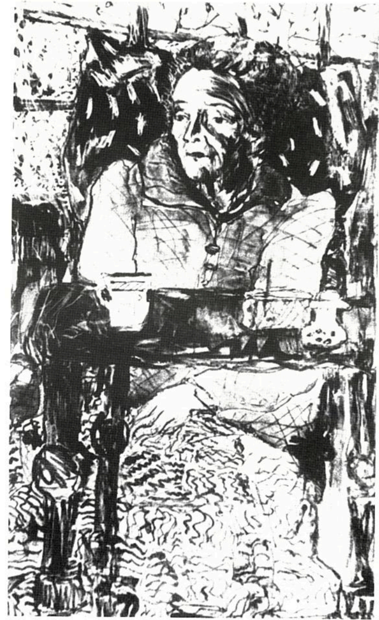
Julie Cook Recuperation 1987, lithograph, 37 x 21.2 cm