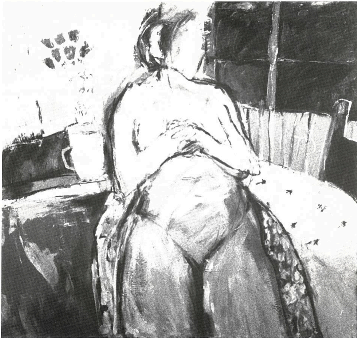
Kay Chun Yesterday 1987, oil on canvas, 97.5 x 102 cm